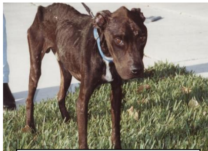
Hagen, first day of rescue