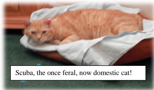
Scuba, the once feral, now domestic cat!